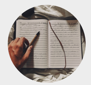
Completed diaries of daily relationship sacrifices